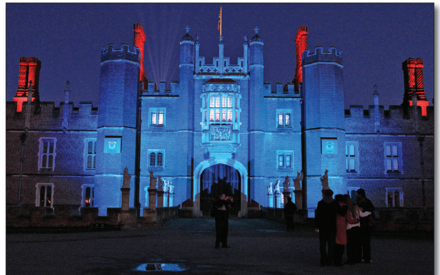
Hampton Court Palace. Henry VIII's historic red brick Tudor palace, spectacularly illuminated at night.