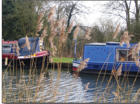
Narrow boats on the River Wey Navigation near Papercourt Lock, Send.