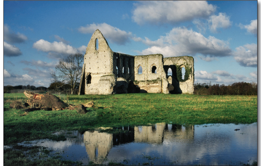
The ruins of Newark Priory, Ripley – dissolved by Henry VIII in 1539.