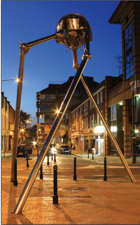
Martian sculpture in Woking town centre, commissioned to mark the centenary of H.G. Wells' The War of the Worlds .