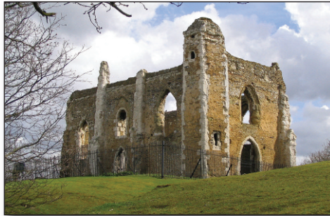
St Catherine's chapel, Guildford – reputedly used by medieval pilgrims travelling from Winchester to Canterbury.